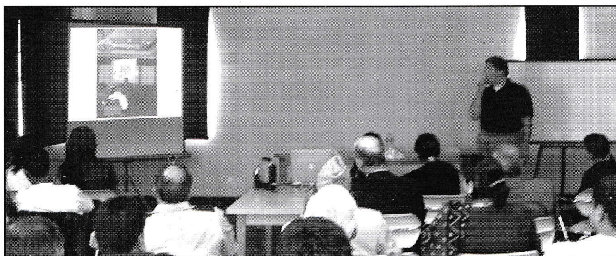
Photo: first monthly talk program on March 23, 2006